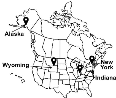
FIGURE 1. Map of sampled populations of breeding Tree Swallows.

weather data ( www.ncdc.noaa.gov ) to generate 2 key variables. First, we recorded maximum daily temperatures for the 25 years preceding this study (1991–2016) for each population. To account for missing data or offline NOAA stations, we concatenated data from the nearest NOAA station with data (distance from field site to weather station = 20.1 \pm 14.3 km). We focused our analysis on breeding months in each population: May to July in Alaska and Wyoming; April to June in New York and Indiana. This 25-year spring average provides a window into the thermal environment in which these populations develop or evolve. Second, we recorded the maximum temperature the day before collection. Because the birds in this study were predominantly collected in the morning (see below), the highest temperature that the birds would have experienced recently is the maximum temperature of the day before collection.